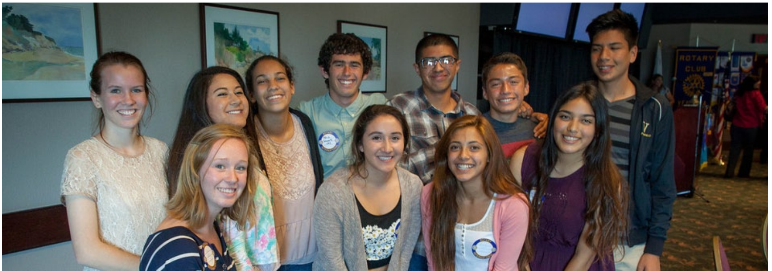
The group of Ventura High School Interactors each spoke about what they enjoy about the club. Proceeds from the bake sale go to fund club projects and activities.