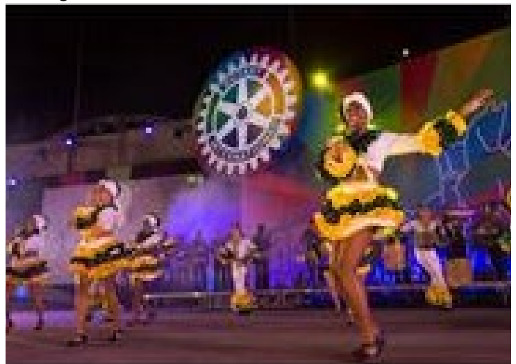
The recent Rotary International convention in Sao Paolo, Brazil, was well-attended.