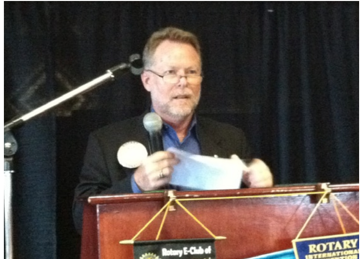
Hutch Hutchinson shared questionable on the books in California.