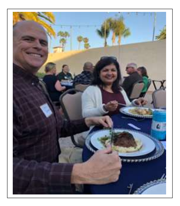
Dinner catered by Peirano's