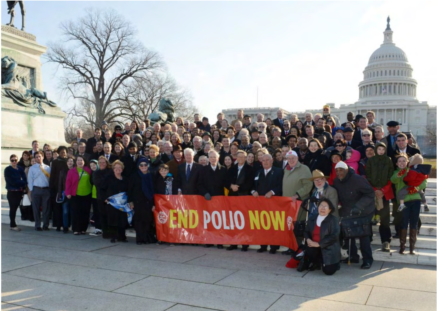
On March 14, 2013 Rotary International leadership and Bill Gates gathered on the National Mall in Washington, D.C. in front of the Capitol to advocate for the fight to end polio.