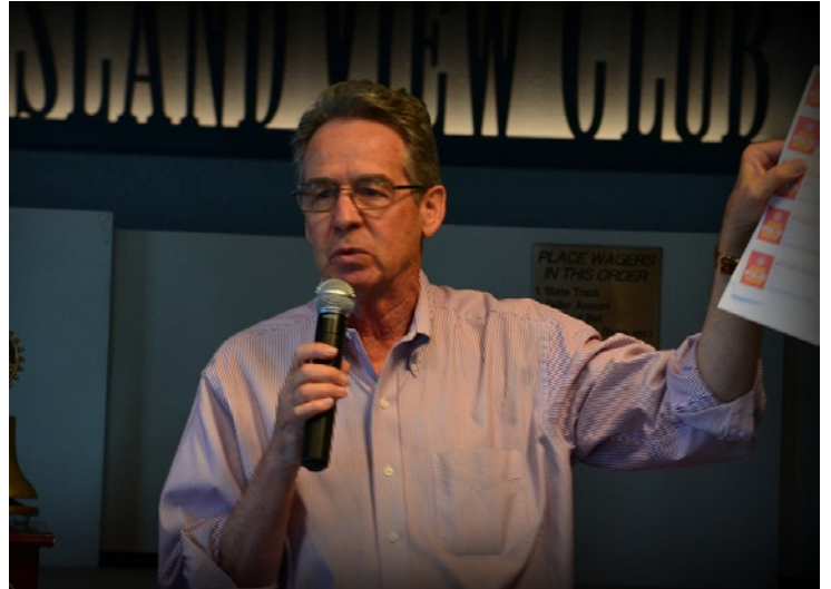
District Governor touts an upcoming Polio Plus event. Check the DIstrict website for more details.