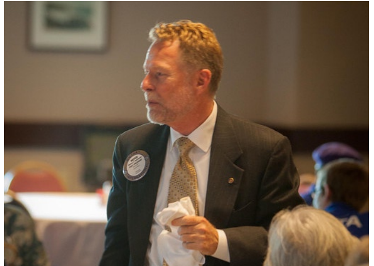
District Governoe touts an upcoming Polio Plus event. Check the DIstrict website for more details.