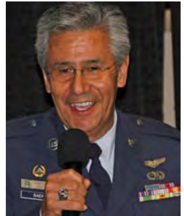
Members of the 1st Military Honor Division each spoke of their service in the five branches of the Armed Forces.