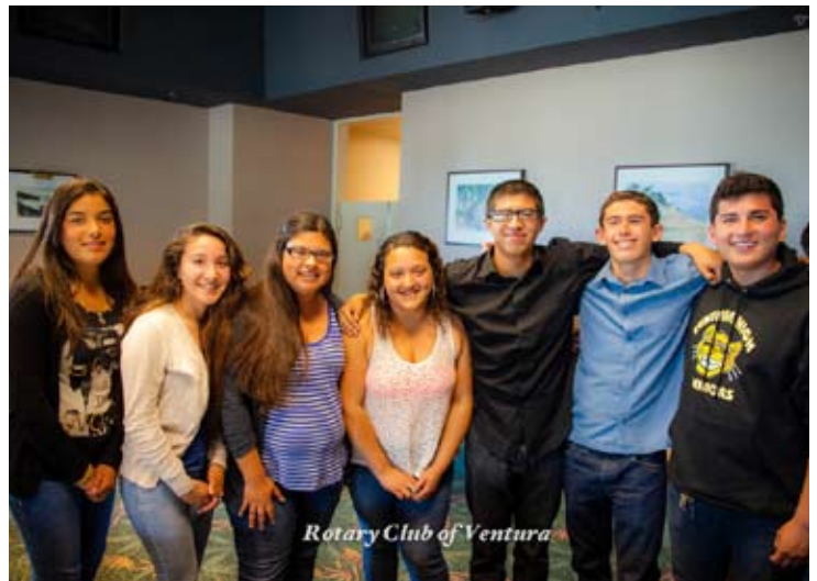
Ventura High School Interactors raised $3,000.00 from their baked goods.