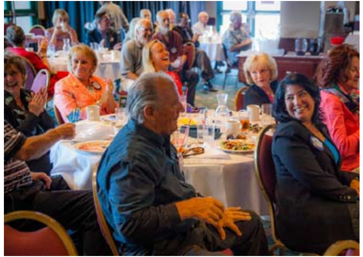
This table enjoys the fun of the auction.