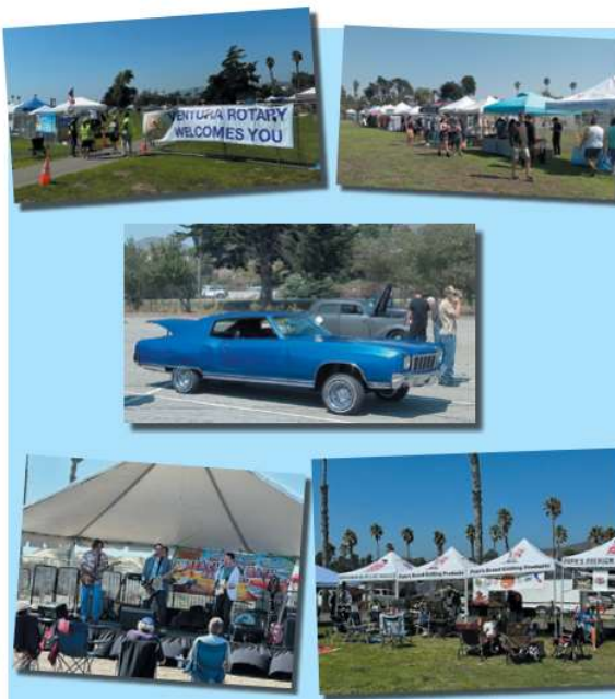
Beachside Bash held at San Buenaventura State Beach Park.