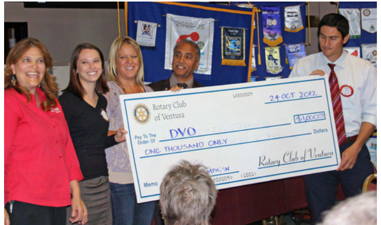
The Downtown Ventura Organization is presented with a check for new lights at the San Benaventura Mission.