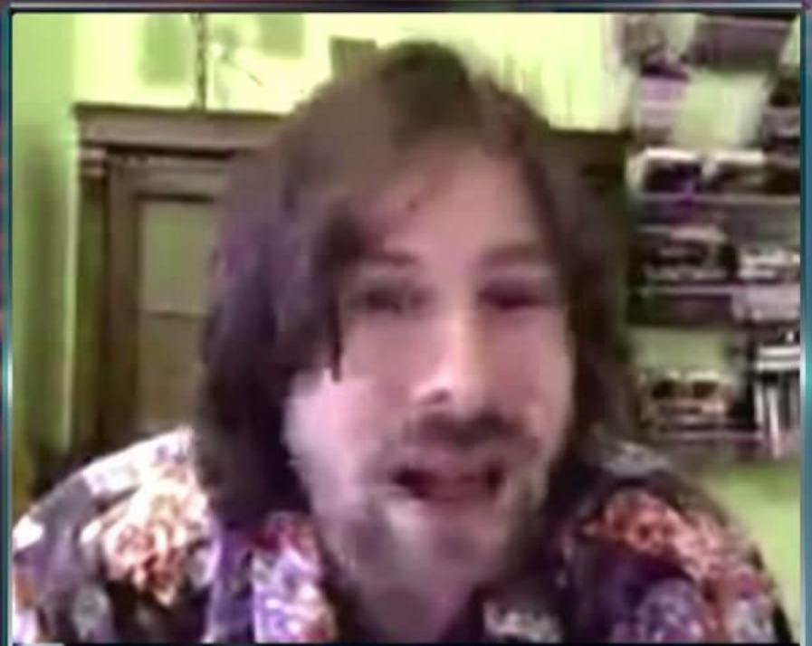
NORTH RIDGEVILLE, OH