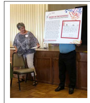
This poster grew legs!

For the program at our September 7 meeting, we invited representatives from 12 non-profit organizations who received a total of $43,500 in grants this year from our Julius Gius Memorial Rotary Foundation. They discussed how the grants are serving our community.