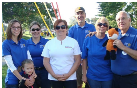
Marion Swamp Fox Festival

P.O. Box 1183 ~ Marion, IA 52302-1082 www.MarionRotary.org