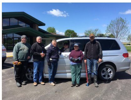
Highway 13 Clean Up "Crew"