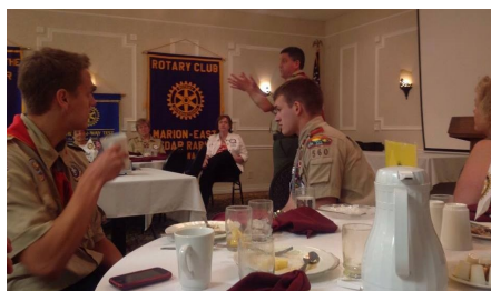
Boy Scout Troop 560, chartered by MECR Rotary Club