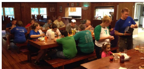
Rotary Day @ Camp Wapsi