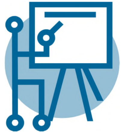
Here's what's going on.

If the year works as planned, we will have a great time rebuilding PARC into the sort of Rotary club that attracted each of us in the first place.