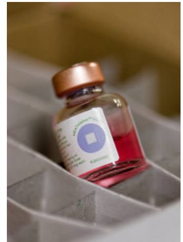
Polio vaccine with heat-sensitive tag awaiting deployment.

Those 31 words are worth remembering when someone asks, "What is a Rotary club?"