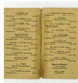
Rotary Club of Chicago member roster, 1905.