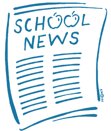
Scottsdale Unified School District Override

"I discovered my passion for education, and specifically for the promise of a universally accessible, high quality public education, through my many volunteer positions in SUSD. I have assisted teachers in the classroom, served as an officer in multiple school parent organizations, been both the President and Legislative Liaison for Scottsdale Parent Council, and have had the privilege of further serving our community on SUSD committees, including a math adoption committee, a technology committee and a budget committee. I have had the opportunity to work with state legislators on issues pertaining to education."