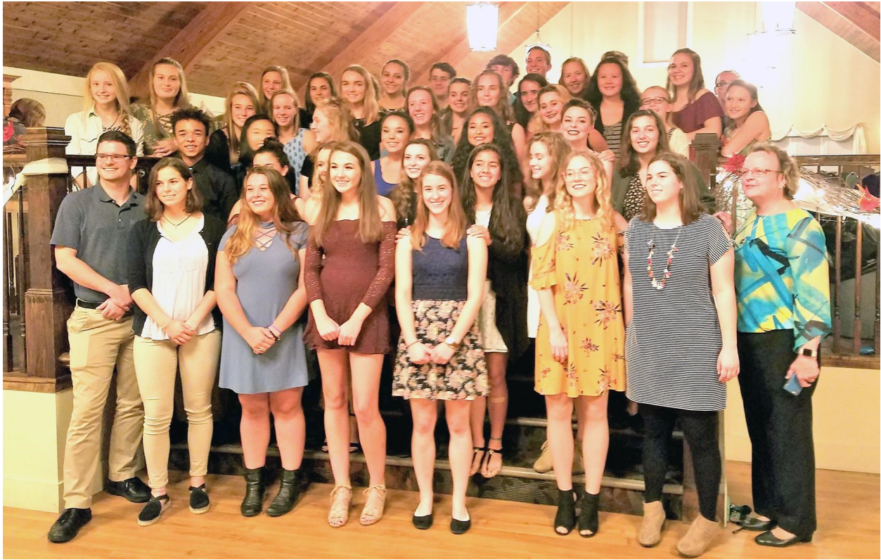
Initiation of the 2017-18 Interact Club took place at the Shattuck on October 24th. 22 new members were inducted. A similar meeting was held the following year.