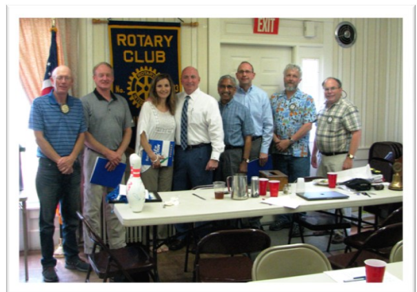
New Member Induction June 2019

Another way you can help! The Membership Committee is always looking for ways to improve the New Member experience Please feel free to share any impressions of your experience and ideas that you might have!