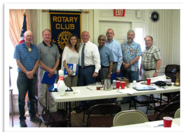
New Member Induction June 2019

Note – the Membership Committee will be looking at ways to improve the New Member experience including suggestions to revive our Mentorship Program and implementing a 4-6 month follow-up meeting with new members. Please feel free to share any ideas that you might have!