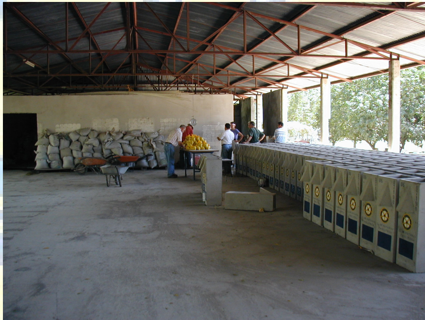
The factory where the filters are made

Filters are delivered to the community in bulk, and residents help with the distribution into the homes, and the PWW crews do the actual installations. After ten to fifteen days, the water coming out of the filter is fresh and drinkable.