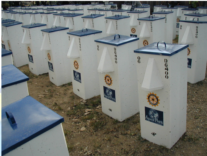
Here is what the filters look like.