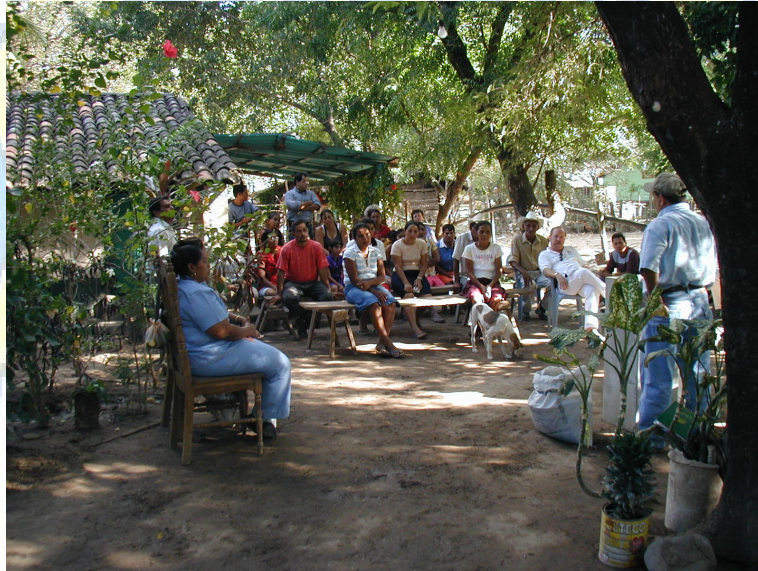
Teaching the villagers about the filters

Starting in areas having the greatest need, community leaders are asked to host an informational meeting where residents can ask questions and have their concerns addressed.