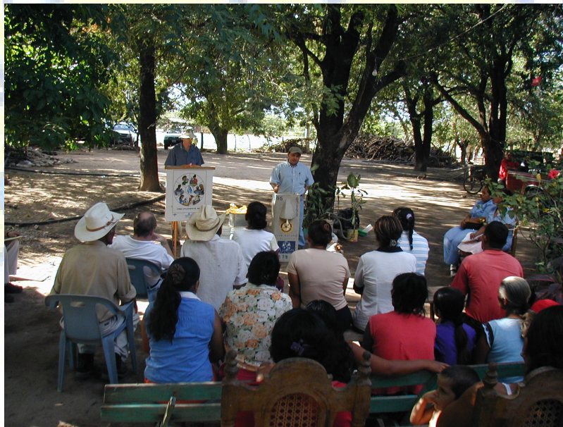
Instruction is done with easy to follow pictures

At the end of the meeting, a filter is set up and installed while the community members watch; the filter is left in place, so local children and adults benefit immediately from the program, and other residents can learn proper filter usage and care.