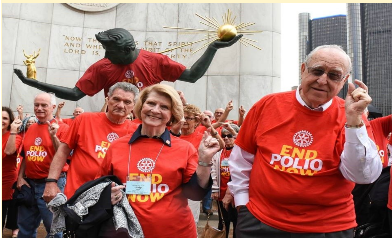
The race to the finish