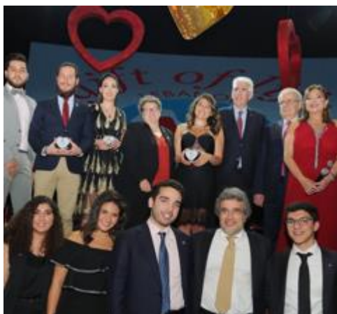
Gift of Life Gala Dinner

The least we can do as humans is intervene whenever another human being's life is at risk and could be saved by a simple operation.