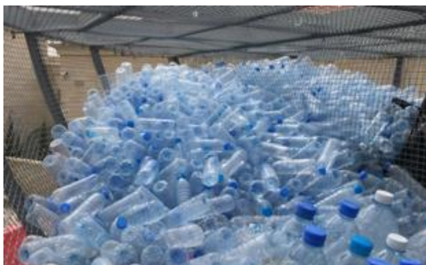
The Bottles Collection Project

We surely owe it all to our Rotary Club who generously contributes to this fundraising every year.