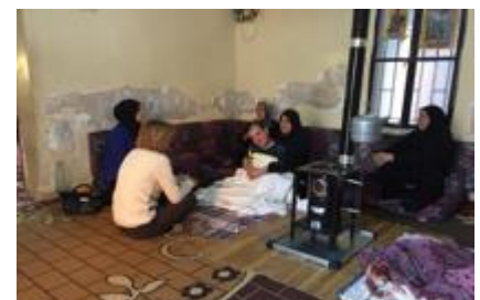
Joint Community Service Project

That's why our third joint project with our sponsoring club Rotary Club of Beirut Cosmopolitan consisted of us joining forces with Rotary Club of Saïda where we contributed 850$ and RCBC adding 400$ for a total of 1250$ to renovate a house in Sour.