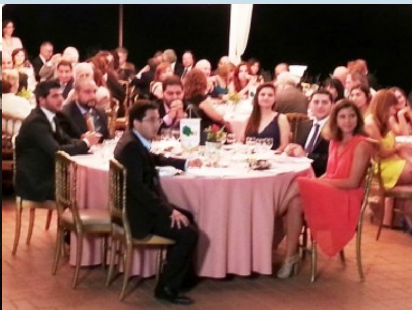
A view of the Al-Bustan Terrace