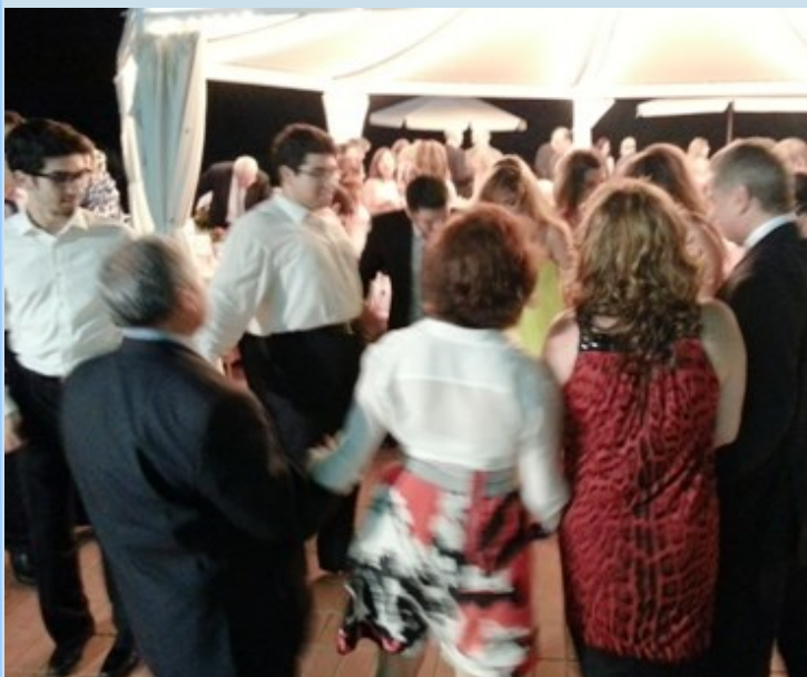
A view of the dance floor

The evening that ensued was uniquely entertaining -- a tasteful balance between the formal and the traditional and the happy partying and dancing.