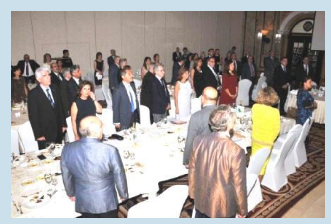
Rotarians and guests standing up for the Labanese National Anthem