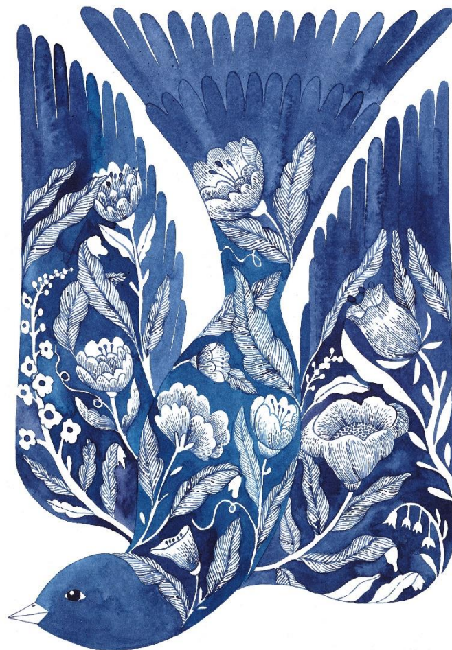
Artist: Malin Gyllensvaan, Sweden