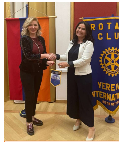
RC Hamlstad (Sweden)