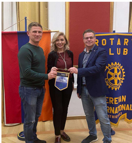
RC Volgograd (Russia)