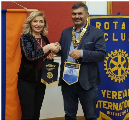
RC Yerevan International