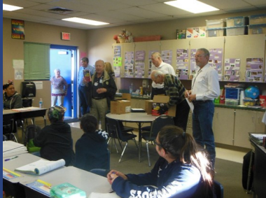
SERVING OUR COMMUNITY