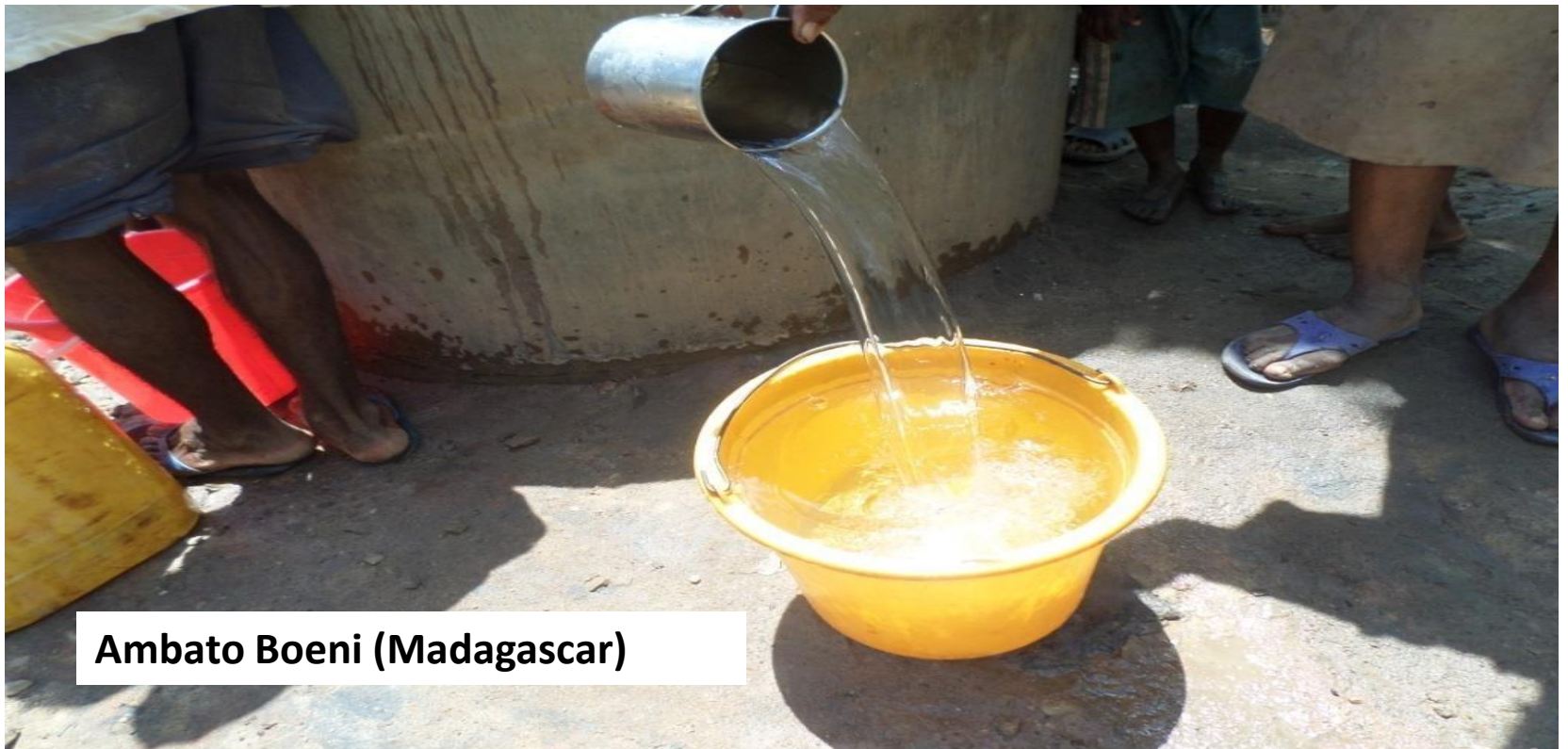
Ambato Boeni (Madagascar)