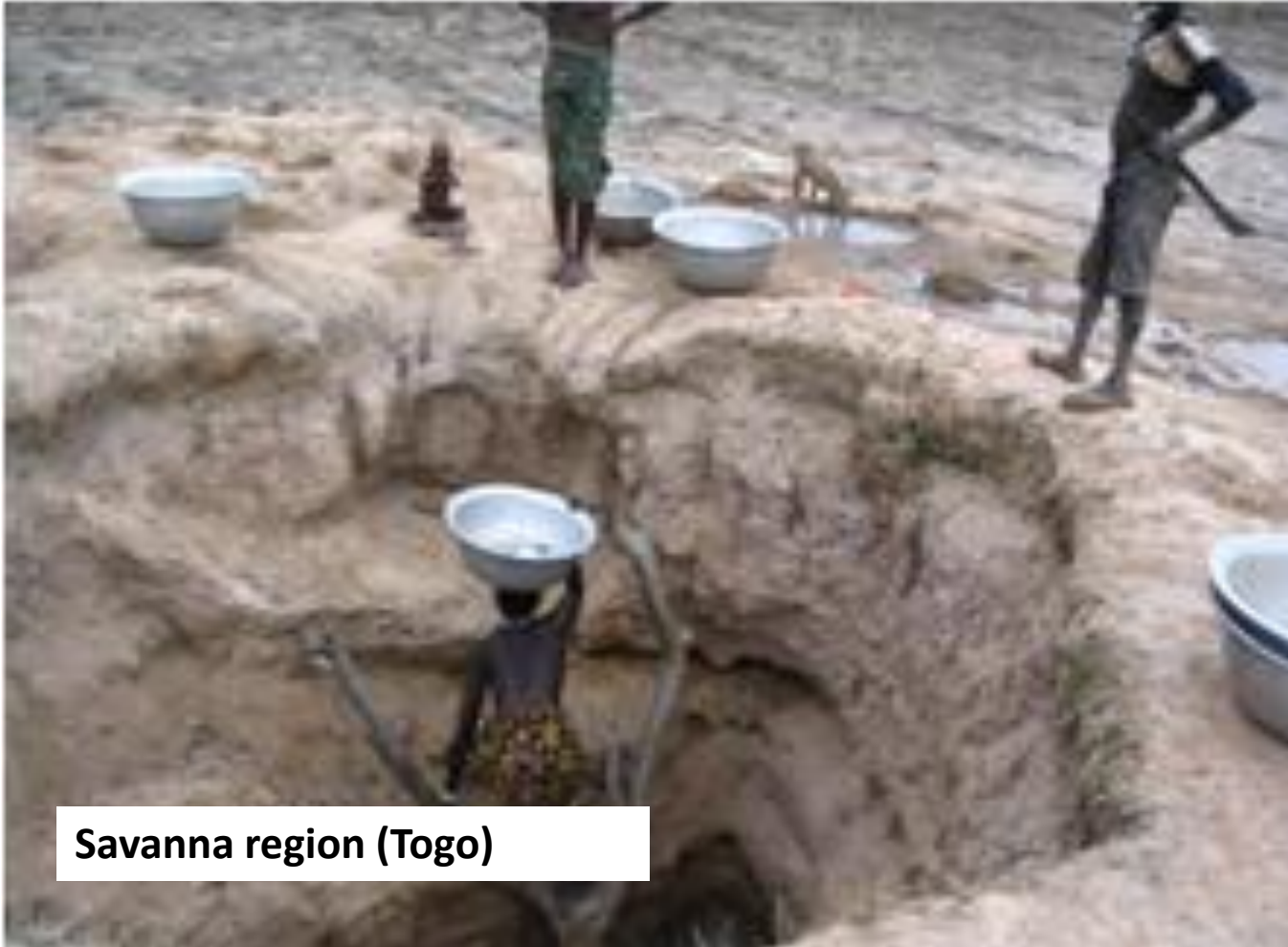
Savanna region (Togo)