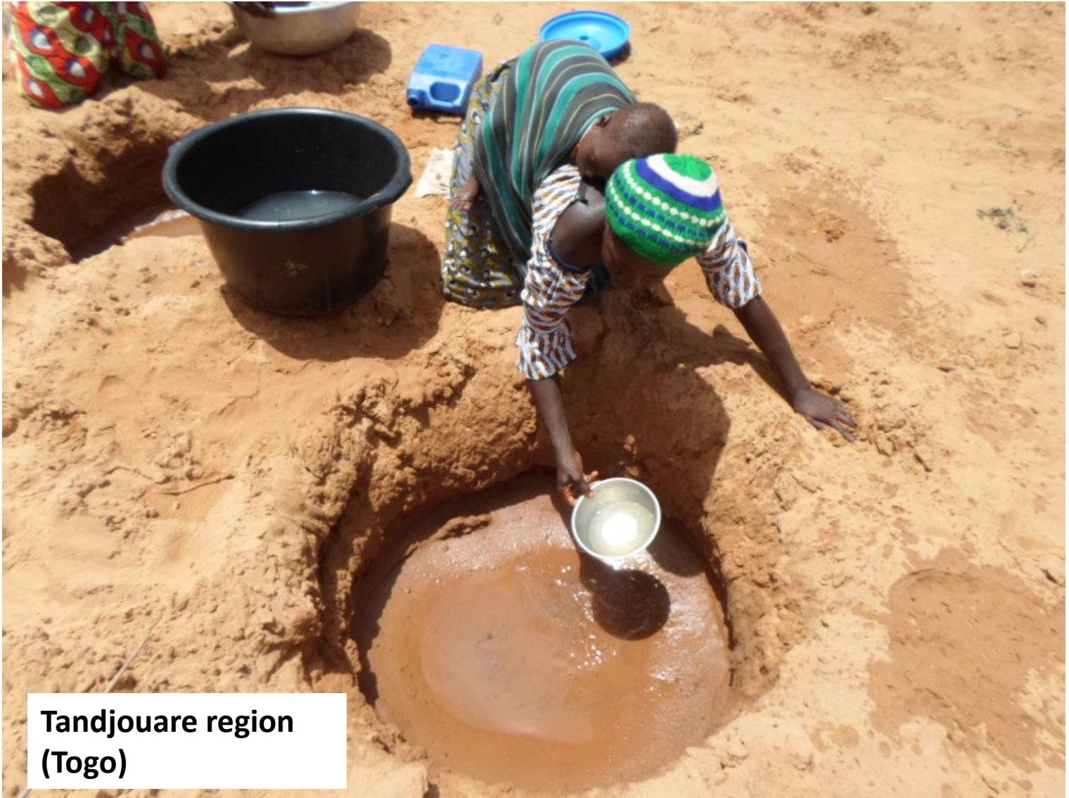
Tandjouare region (Togo)