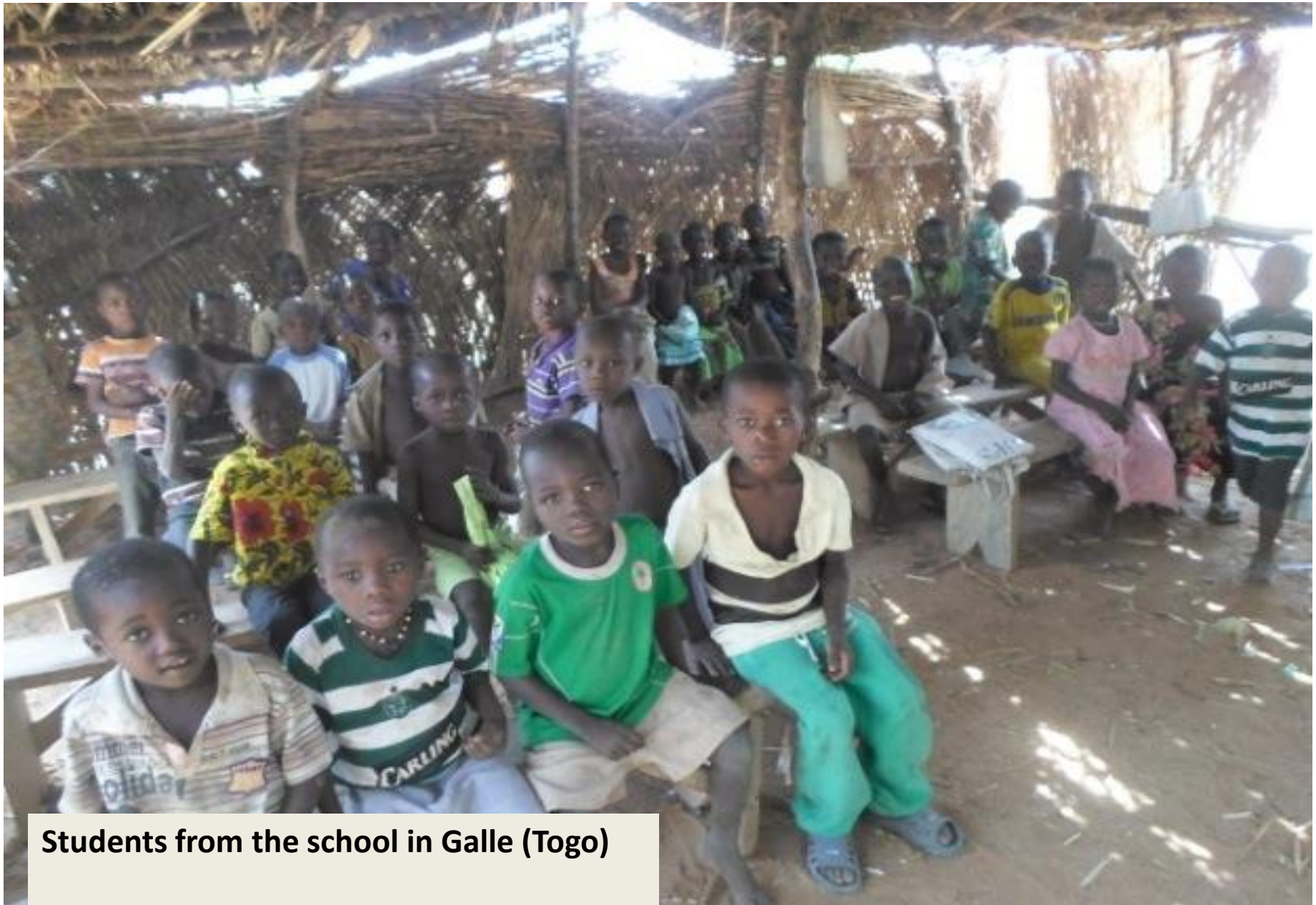
Students from the school in Galle (Togo)