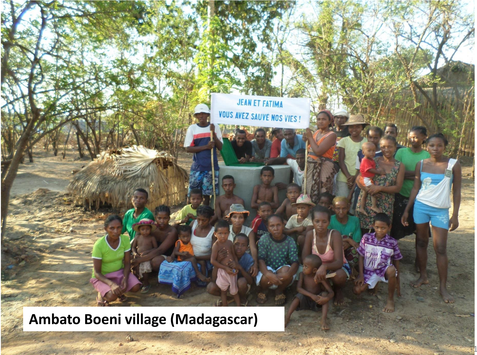
Ambato Boeni village (Madagascar)