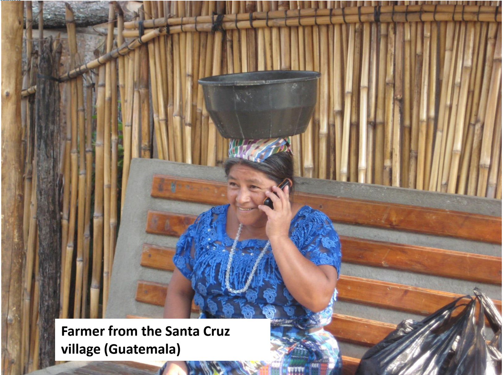
Farmer from the Santa Cruz village (Guatemala)