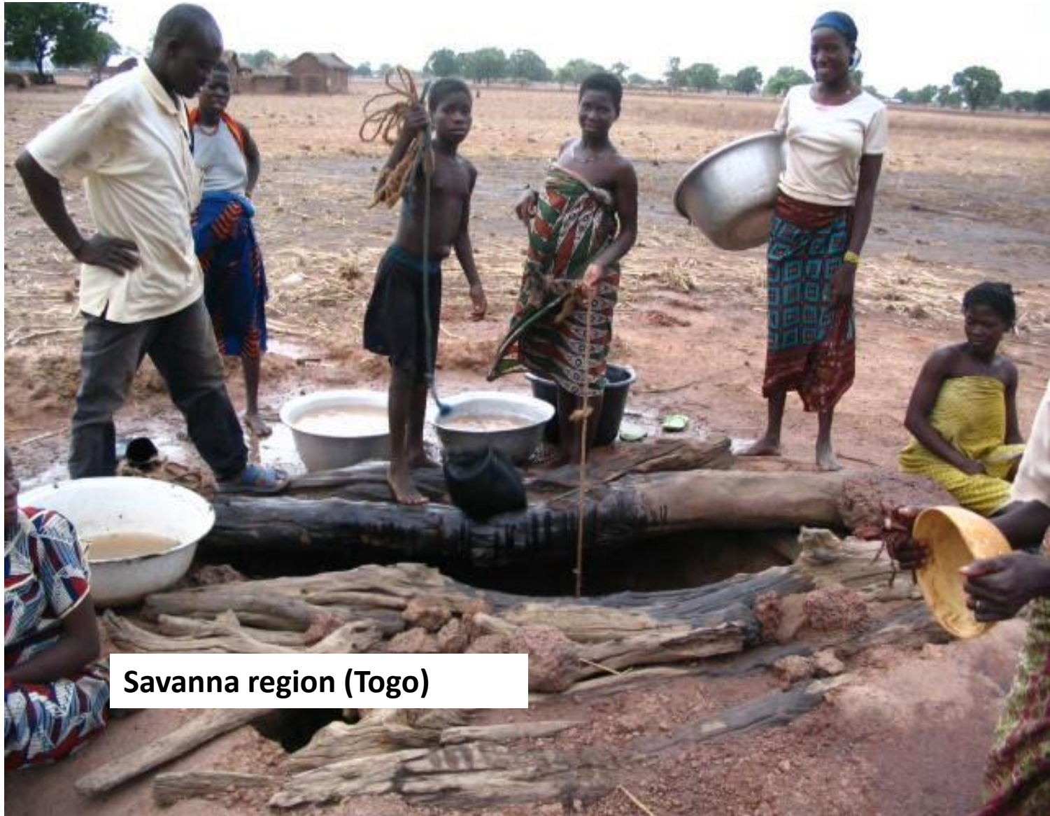
Savanna region (Togo)