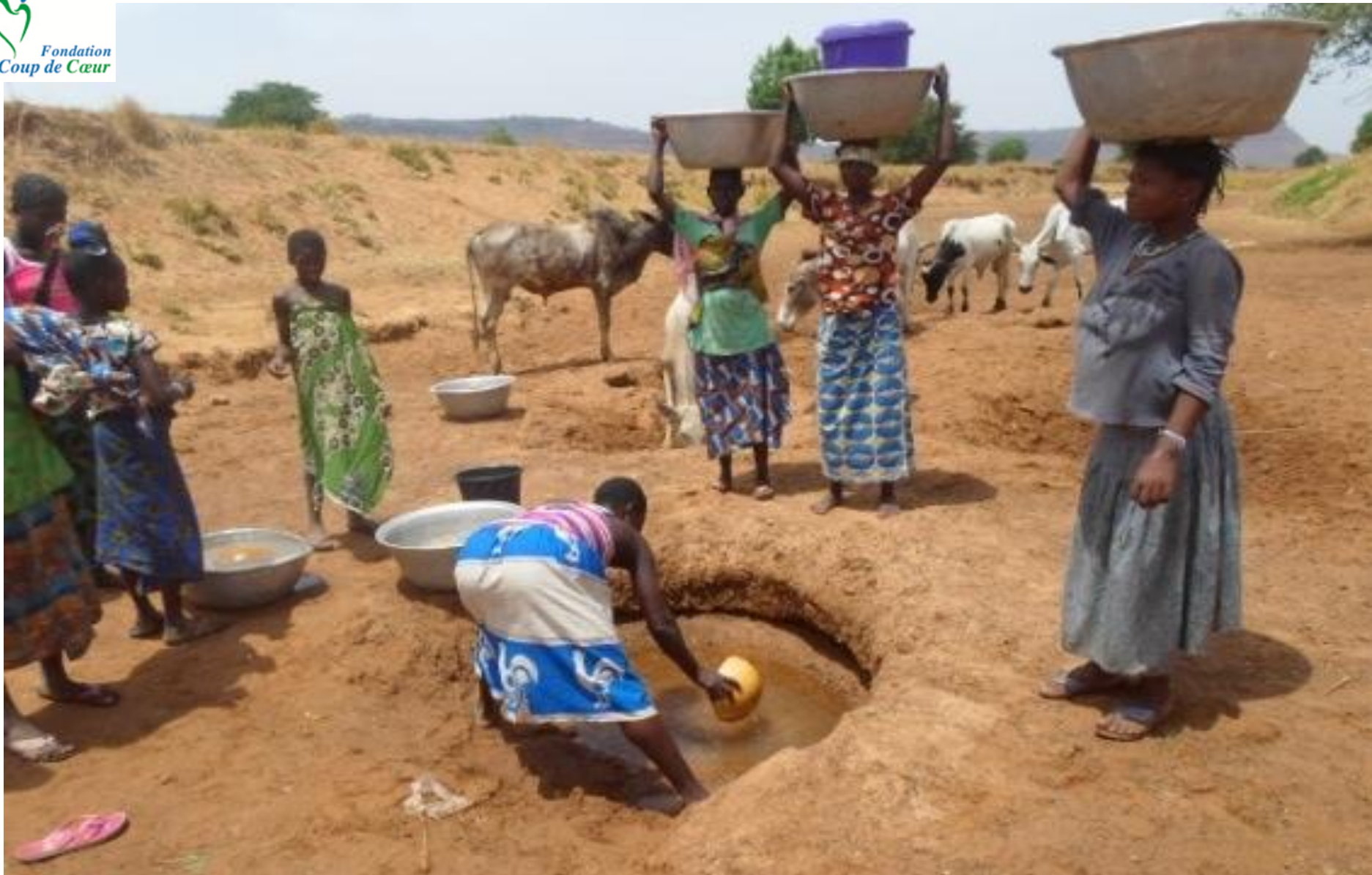
The search for drinkable water in a river between Kamkampiéni and Galle (Togo)