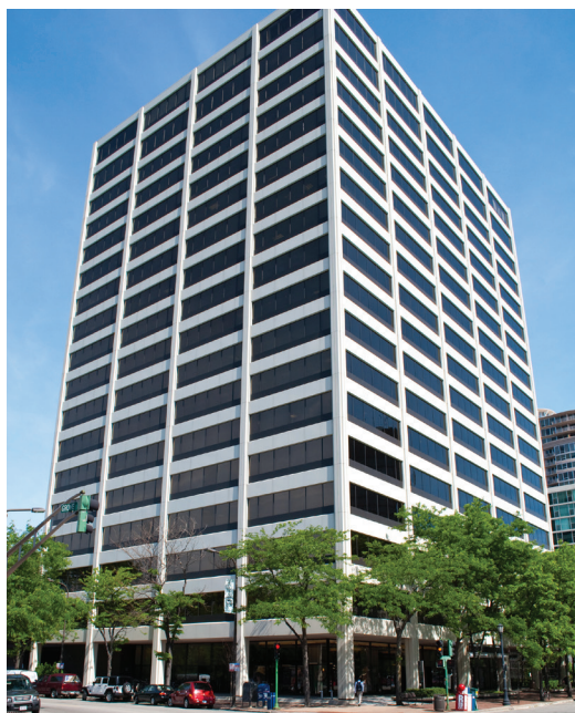
One Rotary Center in Evanston, Illinois, USA

Rotary International is administered by the Secretariat, which comprises the general secretary and nearly 800 employees who work to support clubs and districts around the world. Rotary's world headquarters is in Evanston, Illinois, USA, in a building called One Rotary Center. It includes a 190-seat auditorium, Rotary's archives, and an executive suite with conference rooms for the RI Board of Directors and Rotary Foundation Trustees and the offices of the