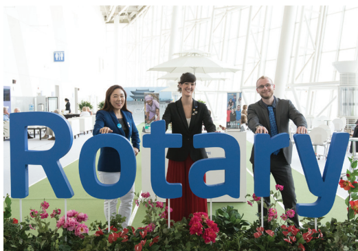
Attendees at 2016 Rotary International Convention, Korea