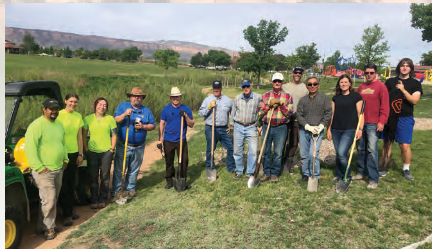
Rotarians and friends planting trees at the Rotary Arboretum in Canyon View park

Board Meetings will be held at 5:00 pm every second Wednesday of the month at 744 Horizon Ct. Suite 350, Grand Junction CO