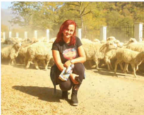
In her free time, she writes rhymes for kids and blogs about nature.