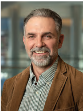
Extension and Engagement in the Western Region of the state.