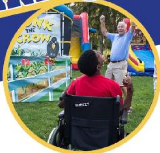
Campers enjoy special events like carnival night, talent show, and prom.