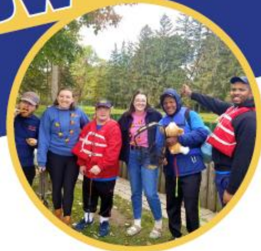
Campers have a fun and memorable camp experience.