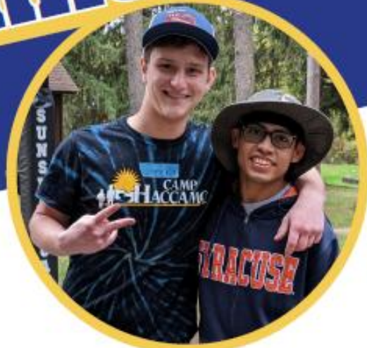
There is a trained counselor for every two campers.