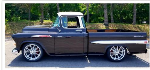
2025 Best of show: 1957 Chevy Pickup

50/50 Raffle Vendors Music Food Door Prizes