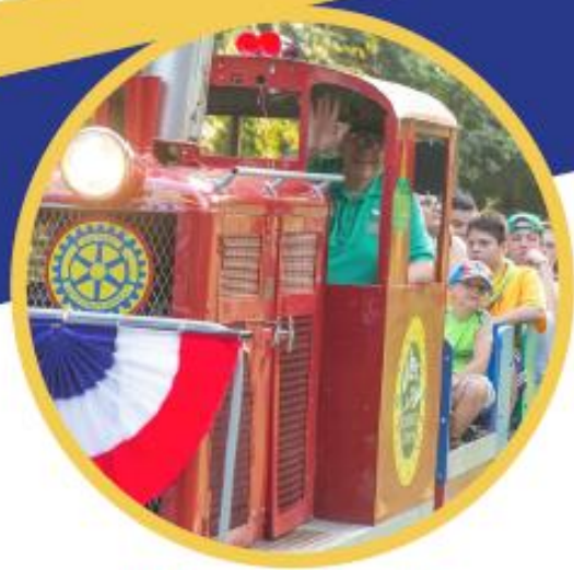
Onboard the popular Camp Haccamo Train.

Camp Haccamo is where people are embraced for who they are. Making Smiles Grow