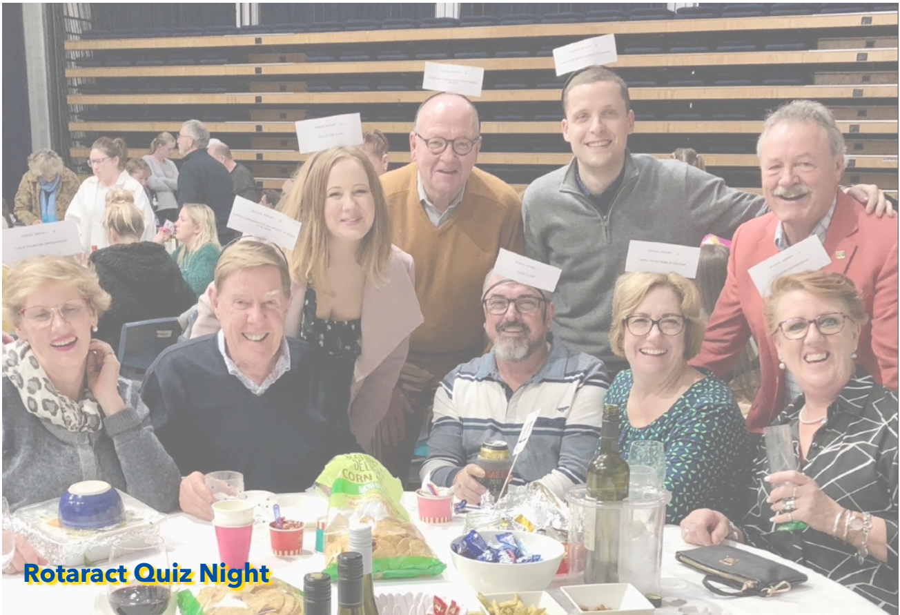
Rotaract Quiz Night