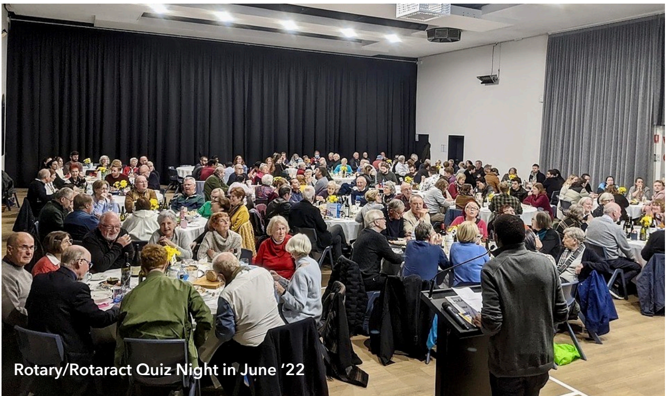
Rotary/Rotaract Quiz Night in June '22