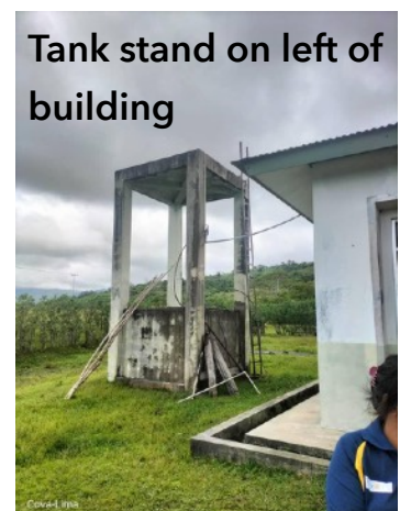
Tank stand on left of building

So, our Committee now has on-ground relationships with the Rotary Club of Dilli and Rotary Club of Dili Lafaeke. Several ideas are being scoped out by RC of Dili, including possible facilities for the School of the Blind and supporting training in equipment sterilisation procedures for health clinics.