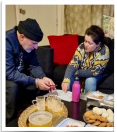
Some new members