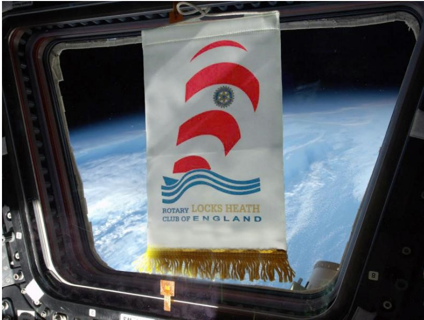
Rotary goes into Space