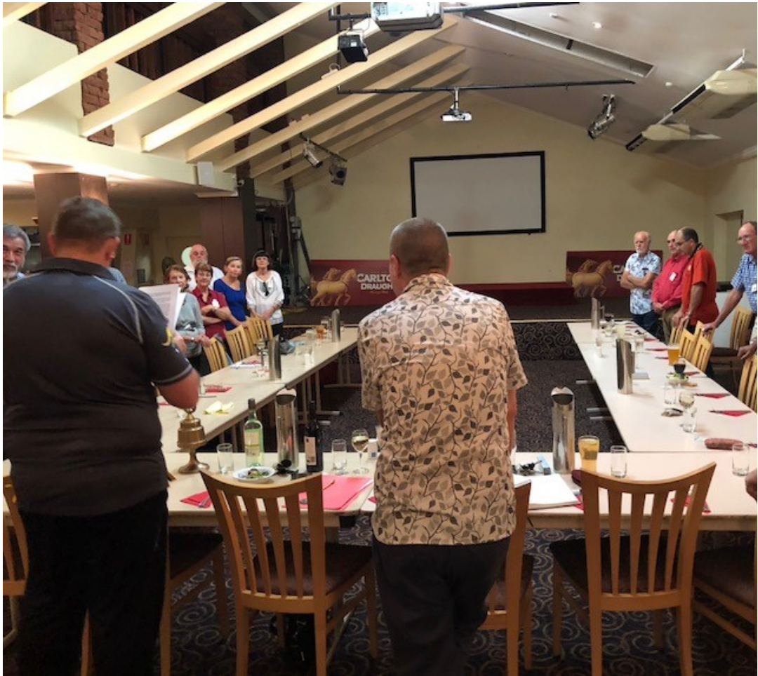
And the meeting has started