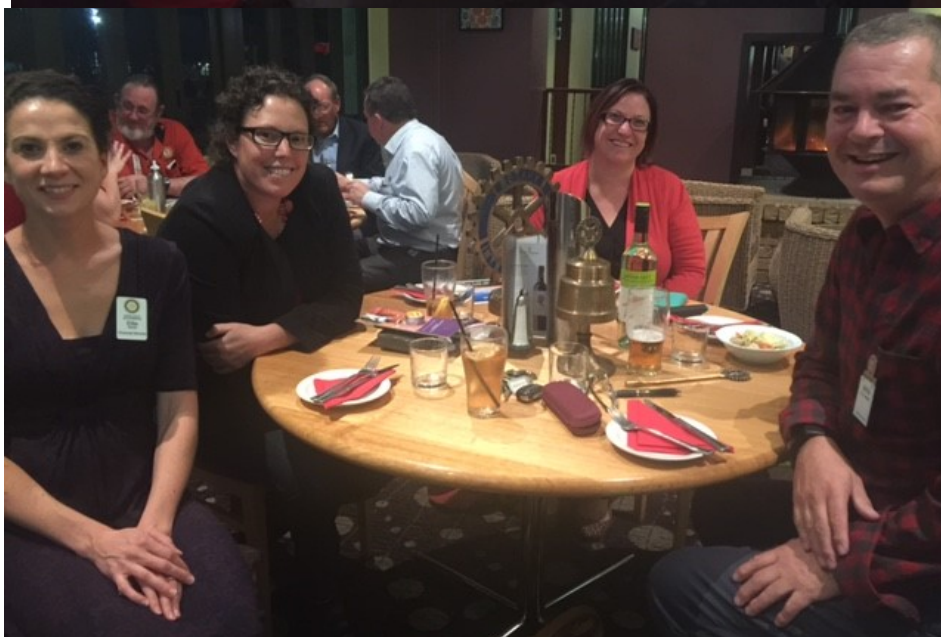
Members and guests enjoying some fellowship