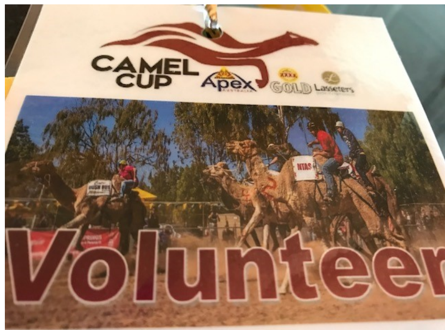
Members recently helped out at the Camel Cup