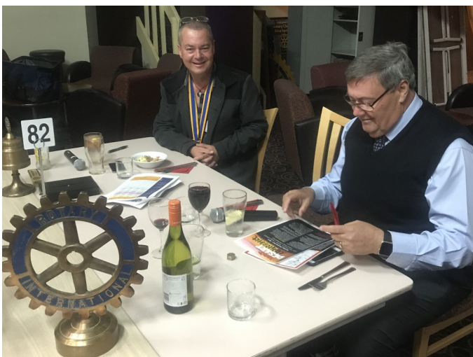
Let's get down to business