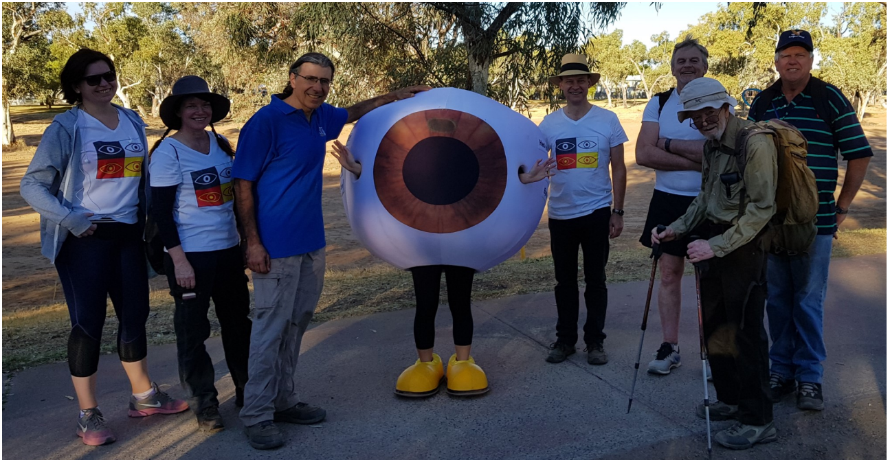
Nice day for a walk.....Hot Desert Trail