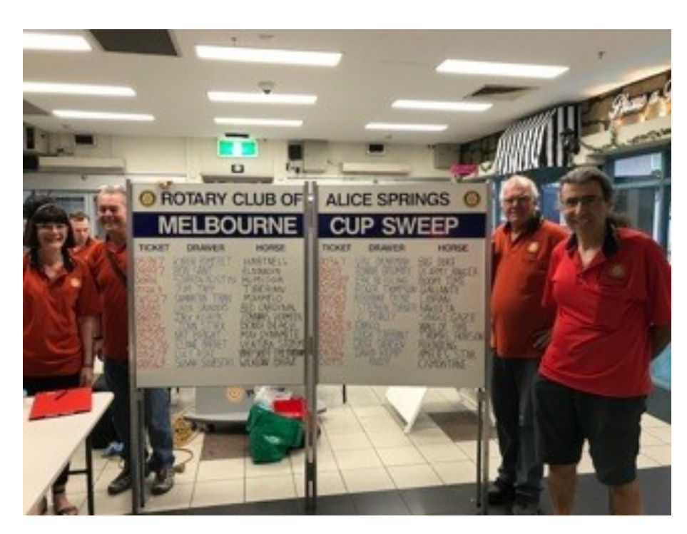
Draw's done.....The Winners