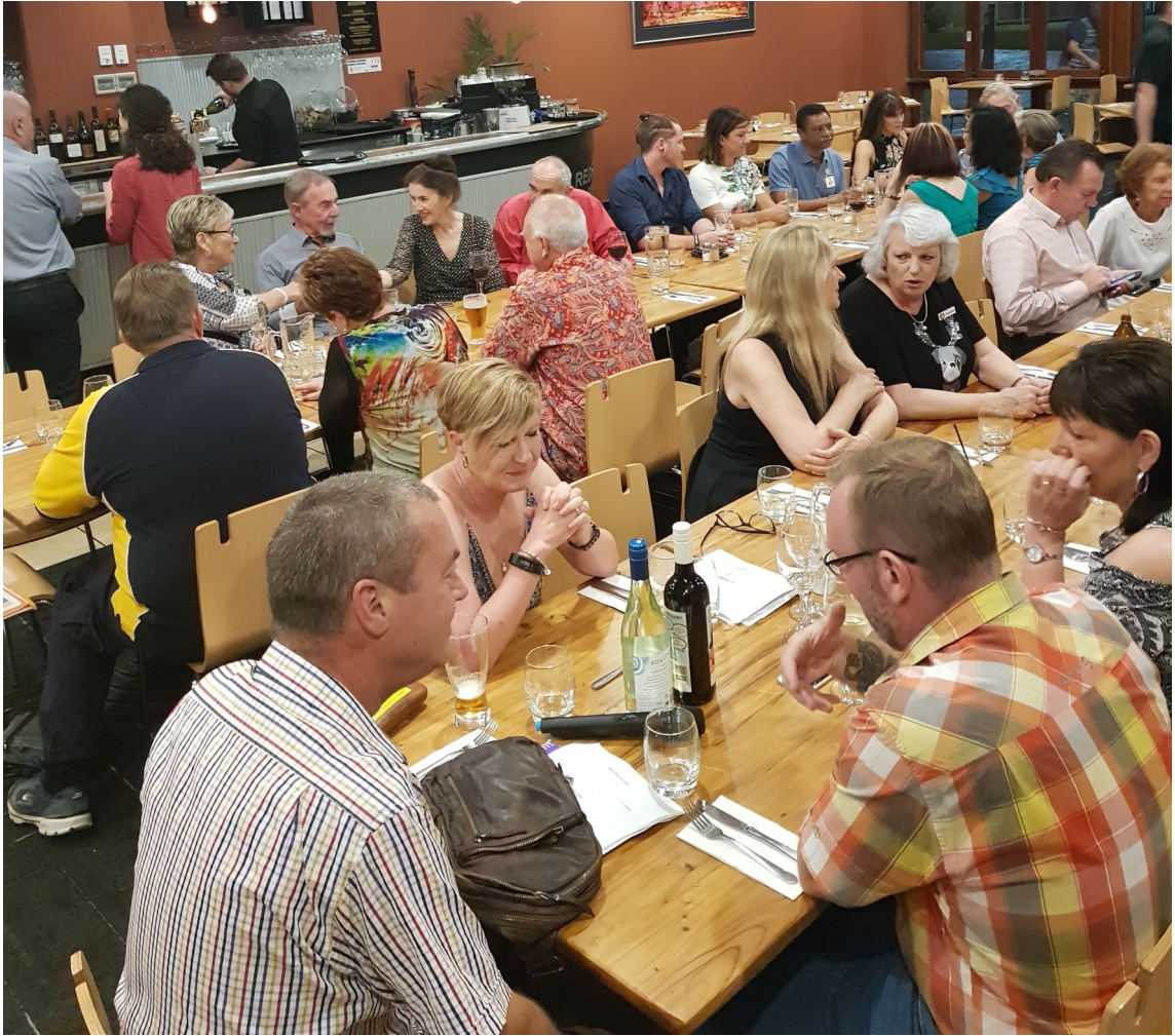
2017 Christmas Party, Red Ochre Grill