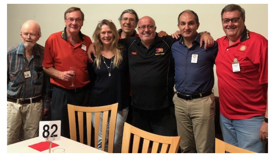
Great to welcome Gman back for a visit