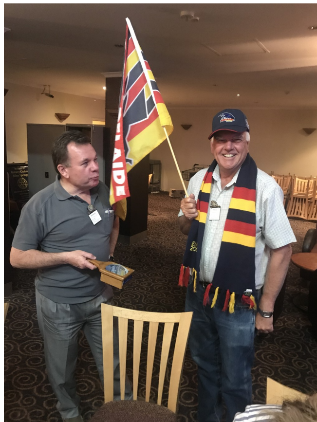
...but he really didn't mind