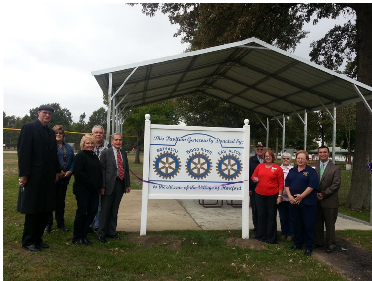
Pavillion by the Hartford water park, built in cooperation by Bethalth, East Alton and Wood River Rotary clubs.