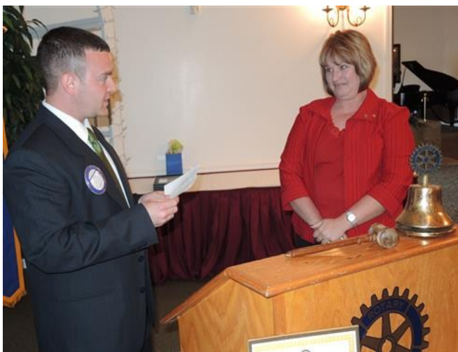
Swearing in the New President

Two old men were sitting in the yard outside the care home one day when Tim turned to the other and said "John I'm really feeling my age today I just hurt all over, how are you feeling?" John replied "I feel just like a new born babe" Tim looked at him startled "A New Born babe really?" "Yep, I have no hair, no teeth, and I think I just wet my pants."