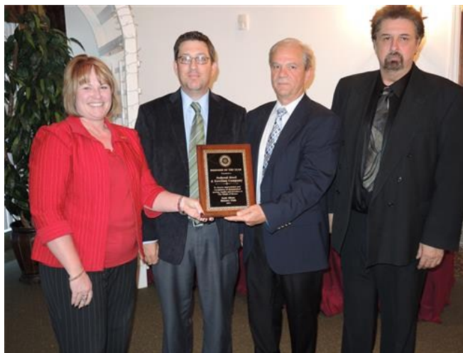
Business of the Year: Federal Steel