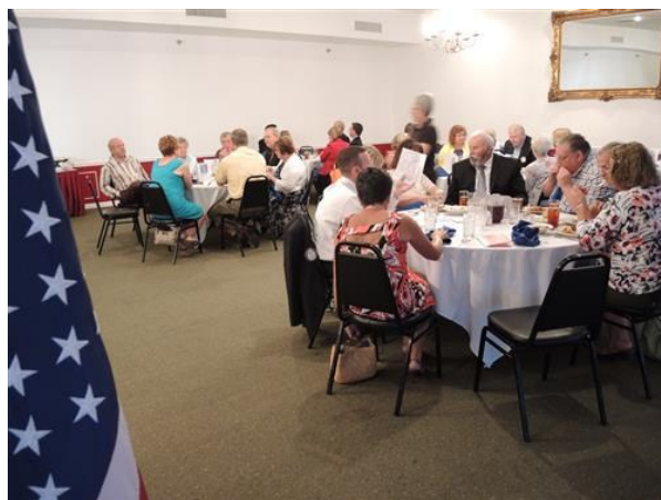
The Installation Crowd