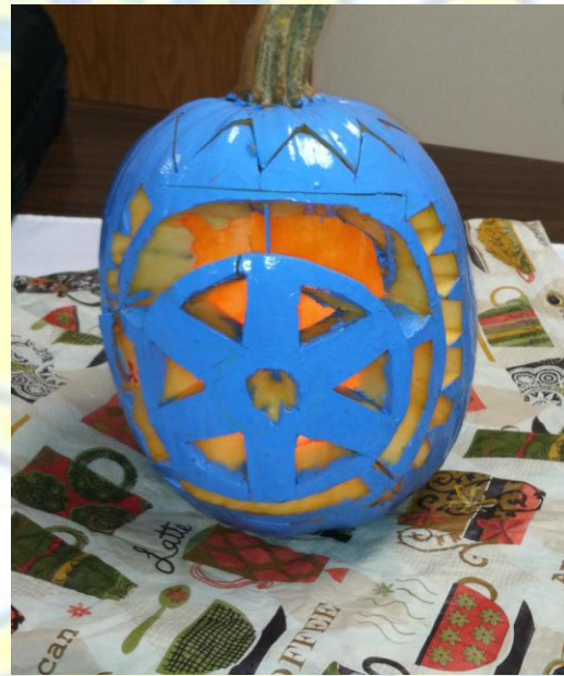
Rotary pumpkin-Thank you, Liza