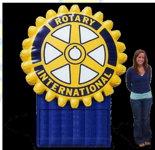
Rotary Inflatable Images

Cindy had an e-mail for a Rotary Inflatable Image. The cost is $259. There was some discussion and the idea was set aside for now.