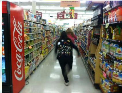
Chasing through store