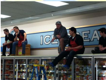
Store employees watching from up above