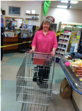
Ready to run