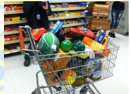
End of run